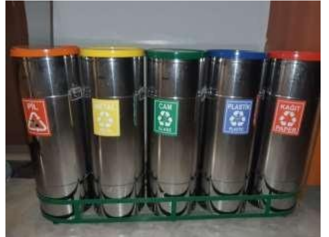
Inorganic waste collection points in the units