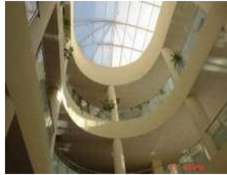
Main Library Building

Carbon Footprint (CO 2 ) in 2022-2023 is 4439,951282 metric tons. It is recorded as 0,14 metric tons of Carbon per person.