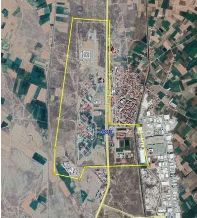
Figure 1: Ahmet Necdet Sezer Campus, which is the Main Campus

Our university has a comprehensive structure that includes programs in many academic fields. Afyonkarahisar, the province where it is located, has a semi-arid climate. The total number of campuses is 15. Ahmet Necdet Sezer Campus, the Main Campus, is located in an urban settlement 10 km from the city center (Figure 1).