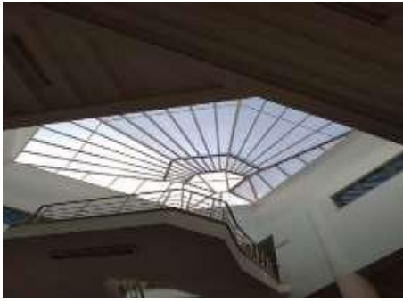
Building of the Institutes

Some application examples of the Green Building in Afyon Kocatepe University Ahmet Necdet Sezer Campus can be seen from the below pictures.